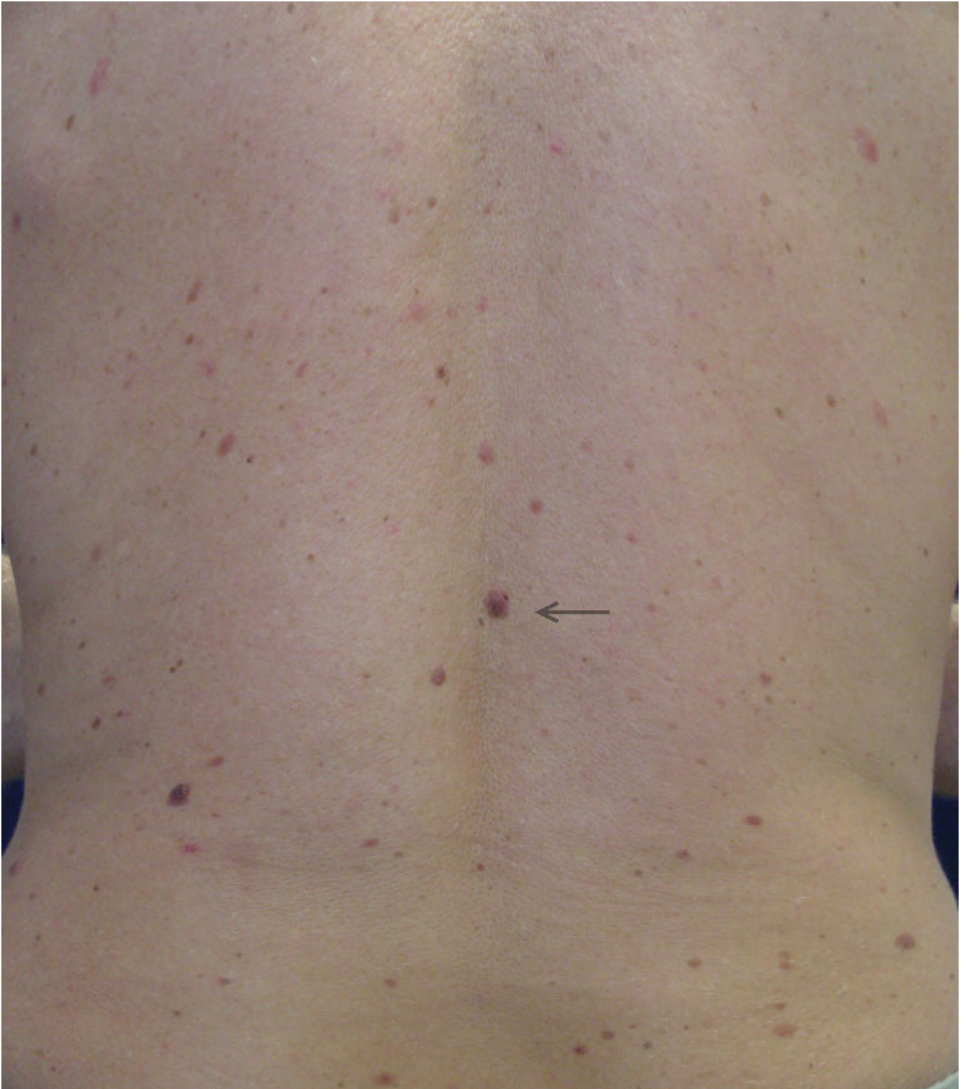
1. Clinical Photograph