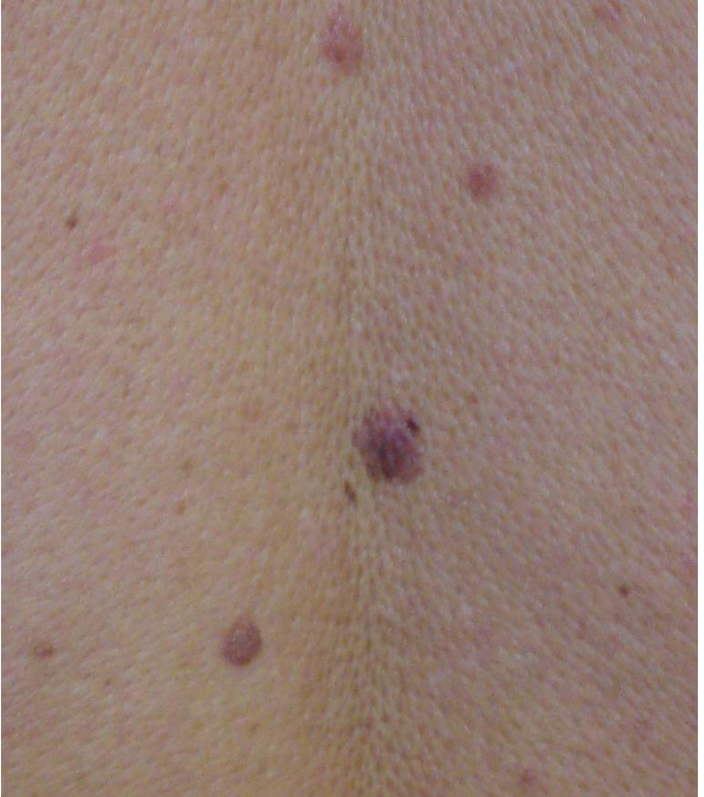
2. Macro Photograph